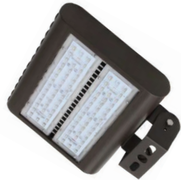
Standard Trunnion Mount