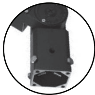
AXL-SF-BR Die-cast Slip-Fitter

Specifications are subject to change without notice. Installation must be performed in accordance with Barron Lighting Group installation instructions.