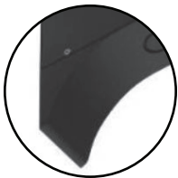
AXL-A-BR Die-cast Arm