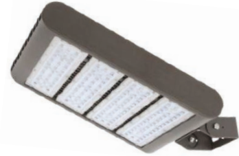
Standard Trunnion Mount