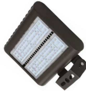
Standard Trunnion Mount