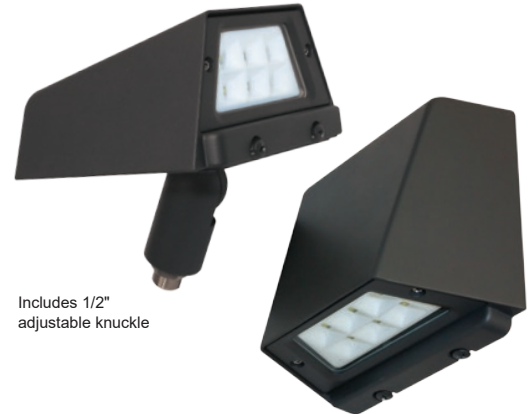
Includes 1/2" adjustable knuckle